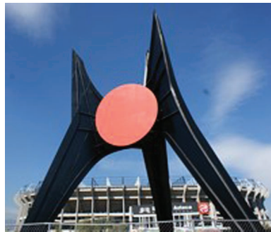
El Sol Rojo (the largest of all Calder's works) installed outside the Aztec Stadium for the Olympic Games in Mexico City.