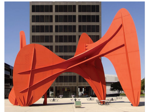
La Grande Vitesse , ("The Grand Rapids") the first public art work to be funded by the National Endowment for the Arts (NEA) for the city of Grand Rapids, MI. (1969)