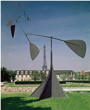
La Spirale , for UNESCO, in Paris (1958)